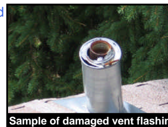
Sample of damaged vent flashing

Type and Condition: Repair needed, plumbing vent lead seals are damaged and will leak rainwater.